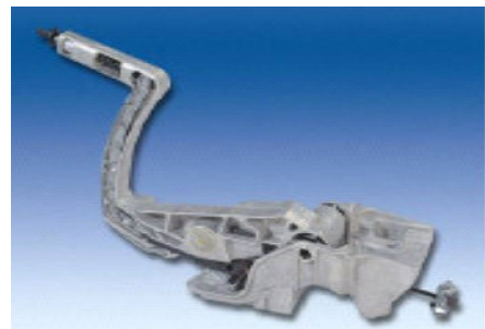
Handbrake lever, magnesium PDC components (Dietz-metall, Germany)

From a design point of view weight reduction opens the door to a highly attractive feed-back cycle. Less structural weight will, other things remaining equal, allow to use e.g. a smaller engine or brake system which in turn allows a lighter structure. The „down-sizing“ spiral will be a dominant theme for the future for better mileage, less CO 2 and improved dynamics. Audi's CEO lately has asked for „most aggressive light-weight design“. In the context of commercial vehicles one kg saved in structural weight is one kg gained in payload. The CO 2 targets set by the European Union as per 2015 will demand a serious slimming diet. It is safe to assume that today not many new specification sheets are released to the design engineers without prescribing a massive weight reduction. And the